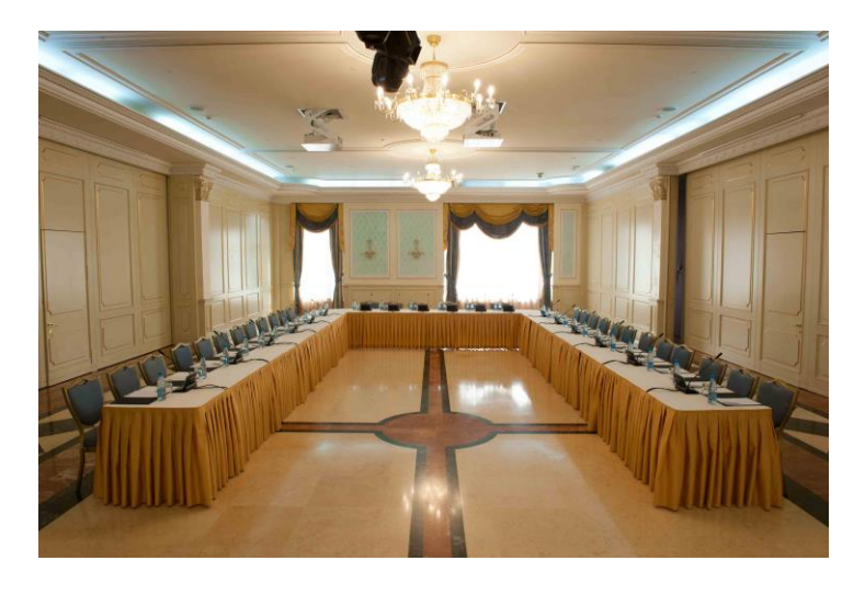
Sary Arka 2