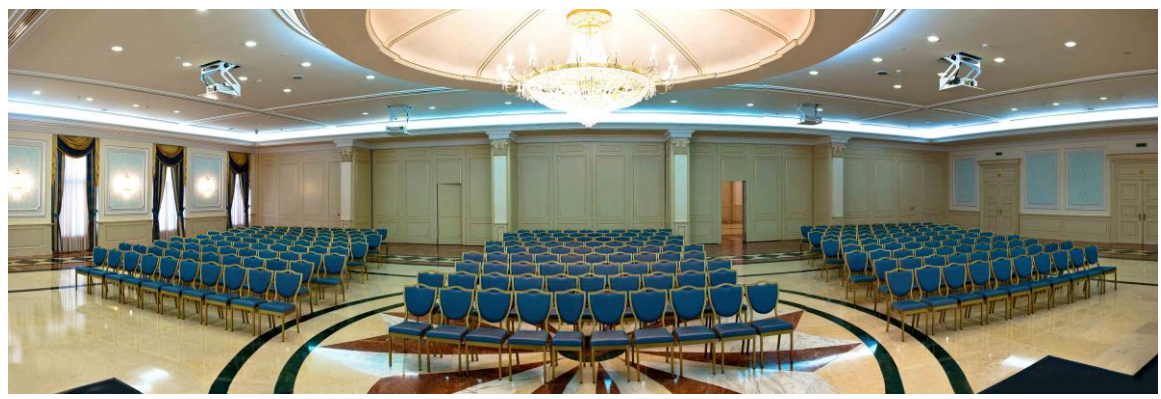
Sary Arka 1