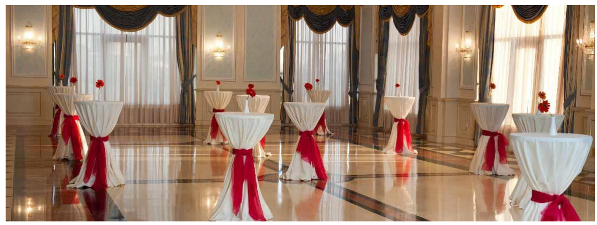
Sary Arka 3